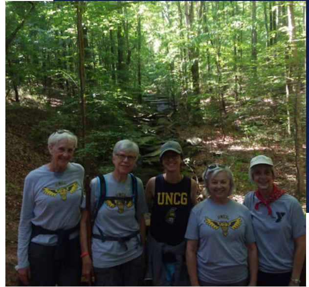
Pictured: Hikers from the Celebrate the Trail to Recovery Program.

After the heat breaks, around four in the afternoon, we move to the back porch and peer out at Antelope Mountain, a majestic range of rock and pine that both humbles me and makes me feel at peace. After two hours or so of tranquility each afternoon, the dog will eventually look up to me signaling it's time to go walk down to the creek. There's some sniffing to do, and she wants to breath in the scents of our surroundings, enjoying each one as long as she can. On this afternoon, as the swallows fly over us, it's safe to say the dog and I feel pretty darn close to complete.