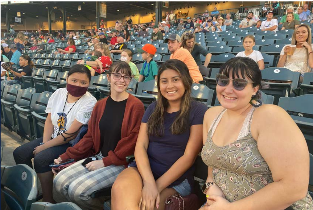
Pictured: CTR Club at the Greensboro Grasshoppers baseball game in September.